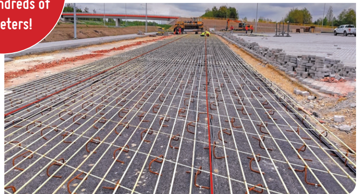
Application of EpsilonRebar in a smart concrete highway