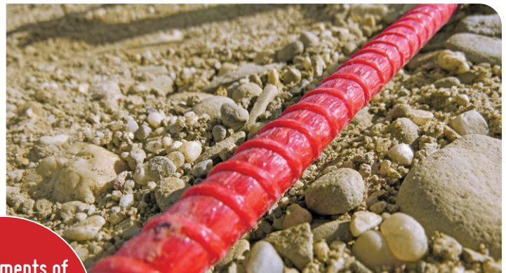
Road embankment with EpsilonRebar

Measurements of structural strains up to hundreds of kilometers!