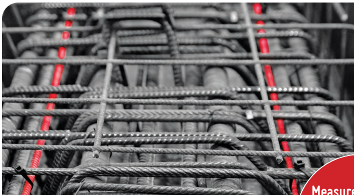
Prestressed concrete beam with EpsilonRebar